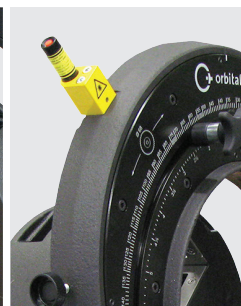
Integrated line laser to determine the cut off point