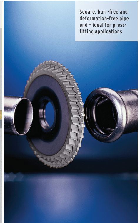
Square, burr-free and deformation-free pipe end - ideal for press-fitting applications

Our GFX series is the ideal solution for cutting of thin-walled tubes. The rugged design for a long product life makes the saws especially economical. Furthermore, the long tool lives thereby increase the productivity.