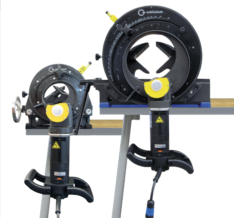
GFX 3.0, GFX 6.6

The technical data are not binding. They are not warranted characteristics and are subject to change. Please consult our general conditions of supply.