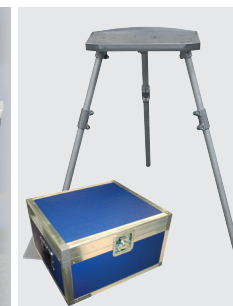
Tripod made of aluminum and high-quality padded blue shipping case for GFX 3.0 optional available