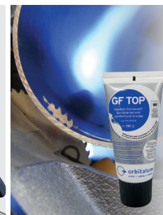
Saw blade lubricant GF TOP included