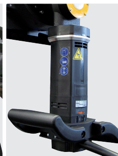
Powerful drive with electronic overload protection and ergonomically designed motor handle