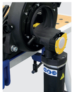
Second saw blade position to cut off elbows