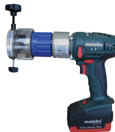
RPG 1.5 Cordless