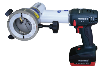
RPG 2.5 Cordless