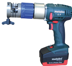
RPG ONE Cordless